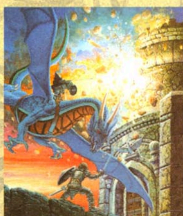
99 When is this (what year in the DRAGONLANCE® Saga timeline)? _____