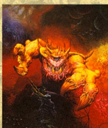
97 What is this (the monster, not the product)? _____