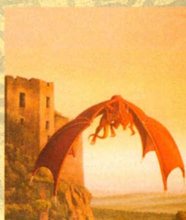
100 Why is this dragon angry? _____