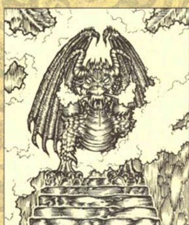
98 Where is this (in what dungeon)? _____